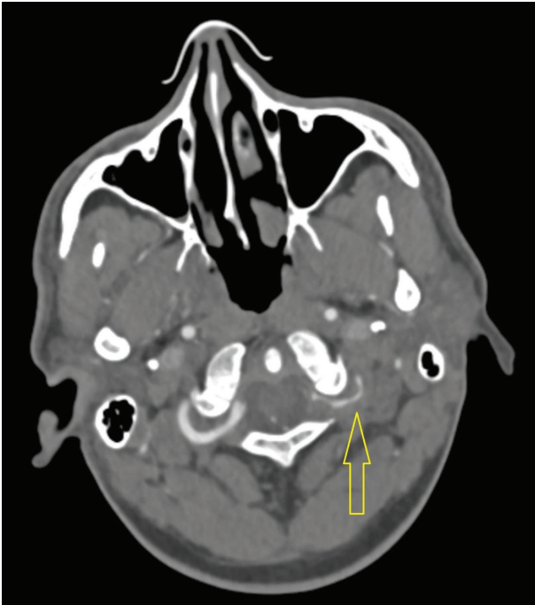
Figure 1. CT angiogram showing left vertebral artery narrowing and dissection.

Romberg's test, but the rest of the cerebellar examination was unremarkable.